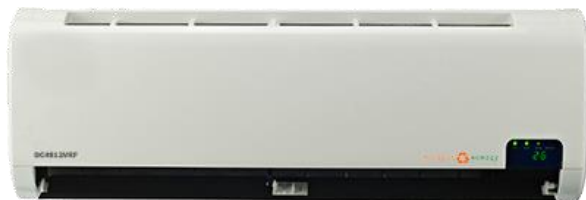
Wall Mount Indoor Unit (IDU)

12,000 BTU 48V DC Heat Pump VRF Dynamic Capacity Compressor 100% DC - No Inverter