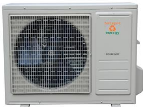
ODU (Outdoor Unit)

Variable Refrigerant Flow & Capacity means that the air conditioner is always the right size for the conditions and is never wasting power.